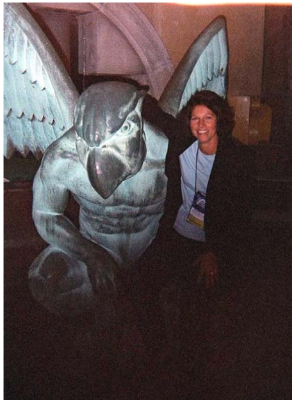
Just hanging out with the 'goyles.