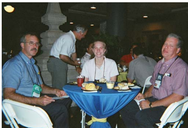
We made some new friends in St. Louis.